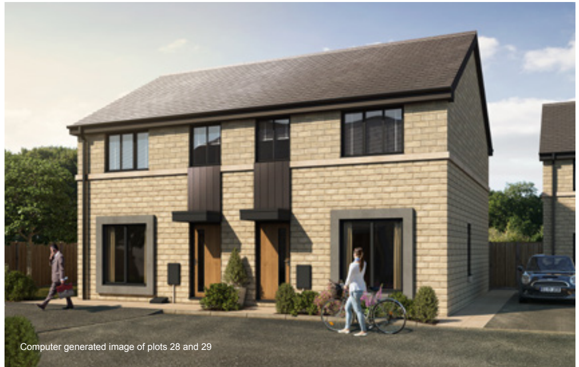
Computer generated image of plots 28 and 29