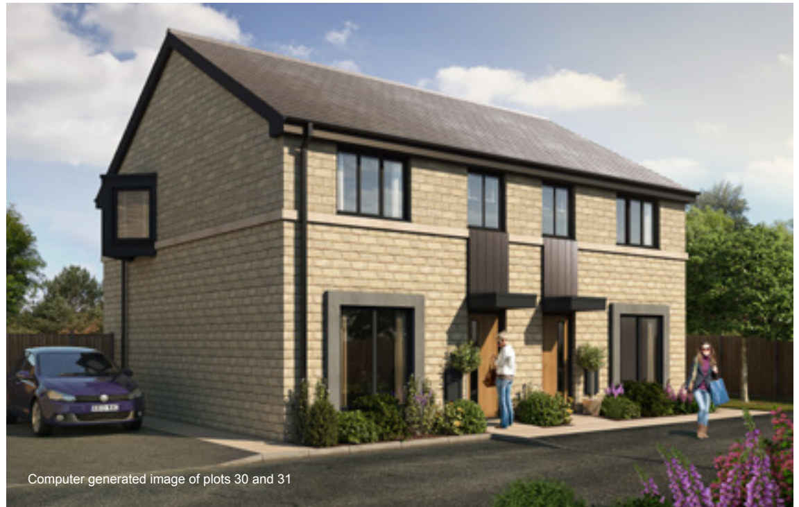
Computer generated image of plots 30 and 31