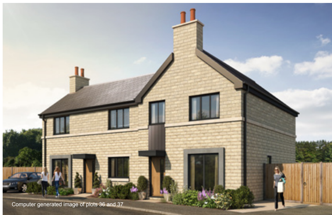
Computer generated image of plots 36 and 37